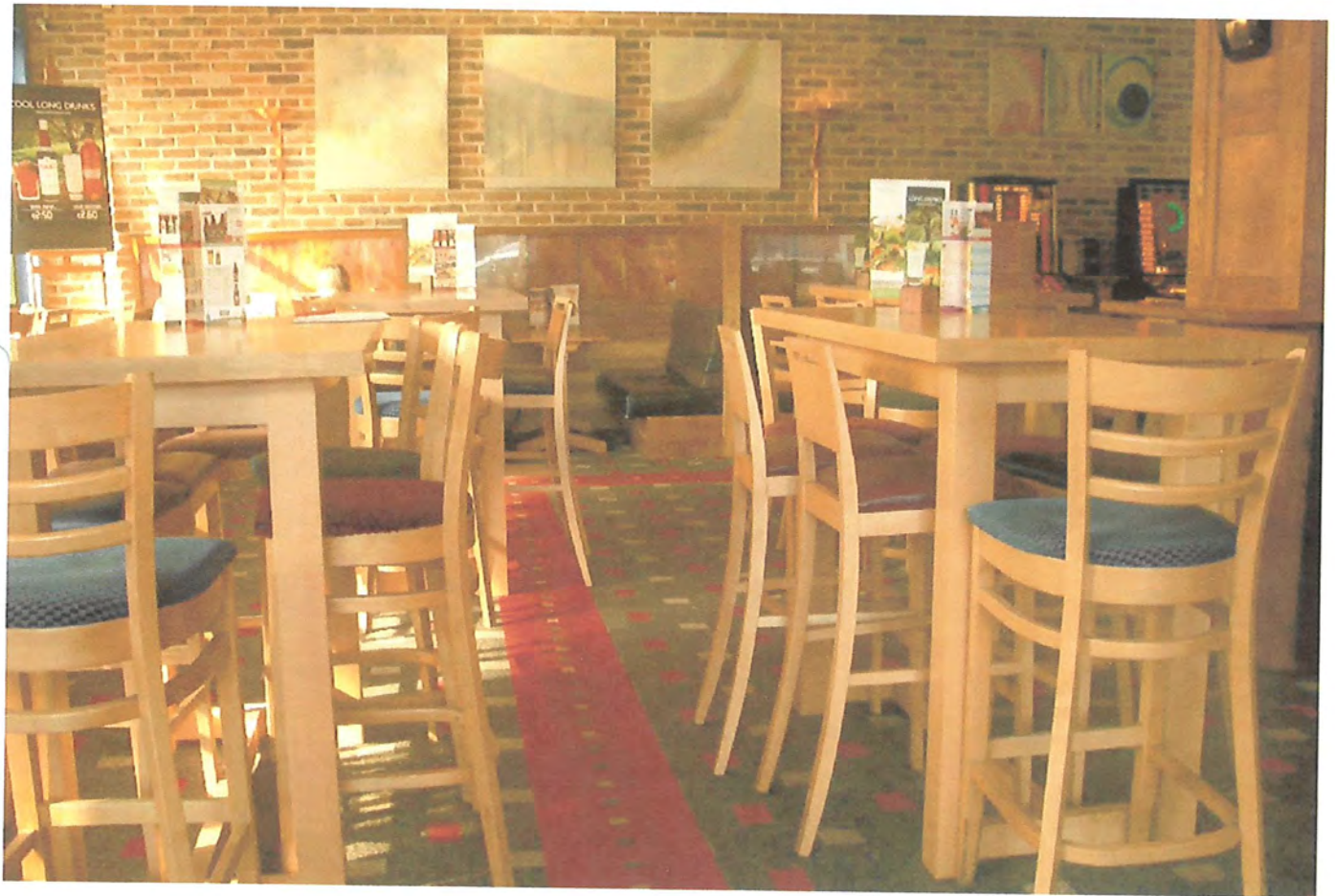
Goodman's Field ATMOSPHERE