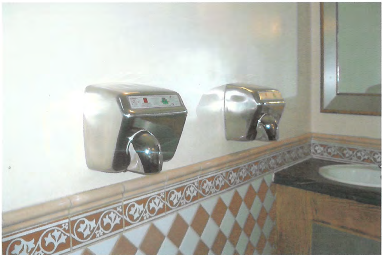
Room above hand dryer for posters