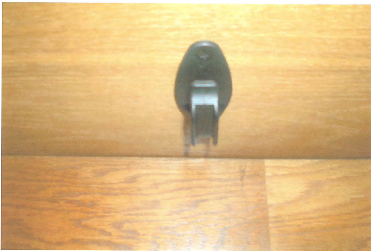
Chelsea Clips on most tables. But no signage anywhere.