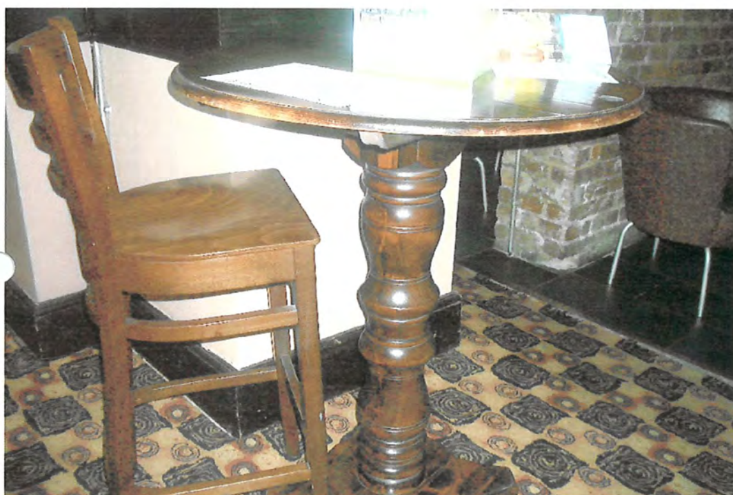
ROUND TABLE WOOD LEG