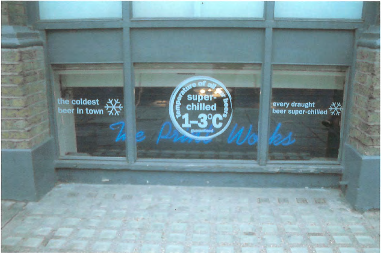
Pub in basement level.