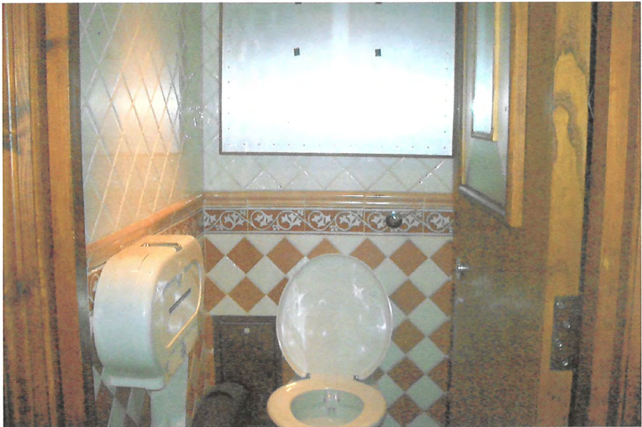
Metal frame behind toilets. Possible to hang information.