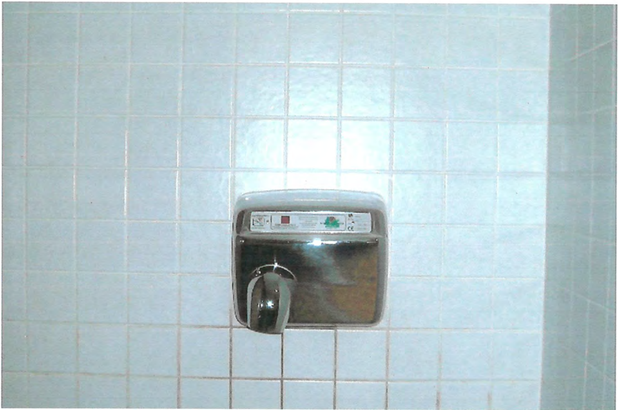
Space above hand dryer for poster