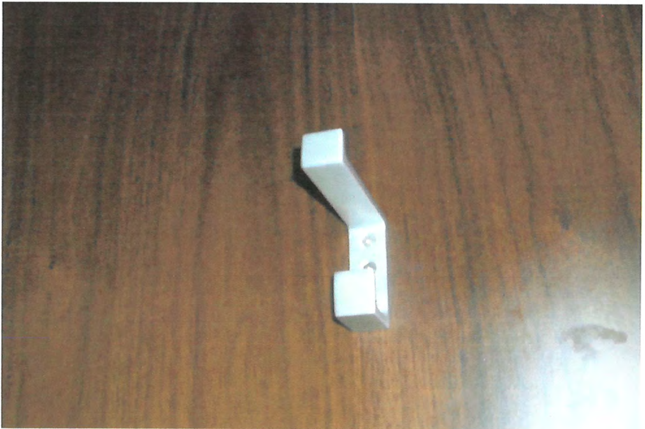
Hook on back of stall door for info