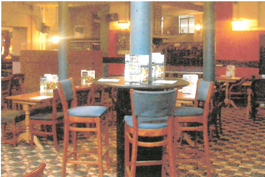
COLUMN SHELF H = 120 cm