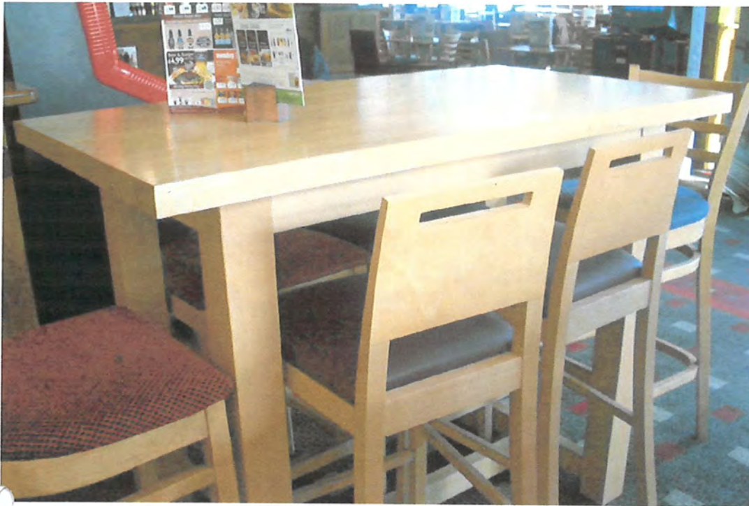
TALL RECTANGULAR TABLE L = 137 cm W = 76 cm H = 109 cm