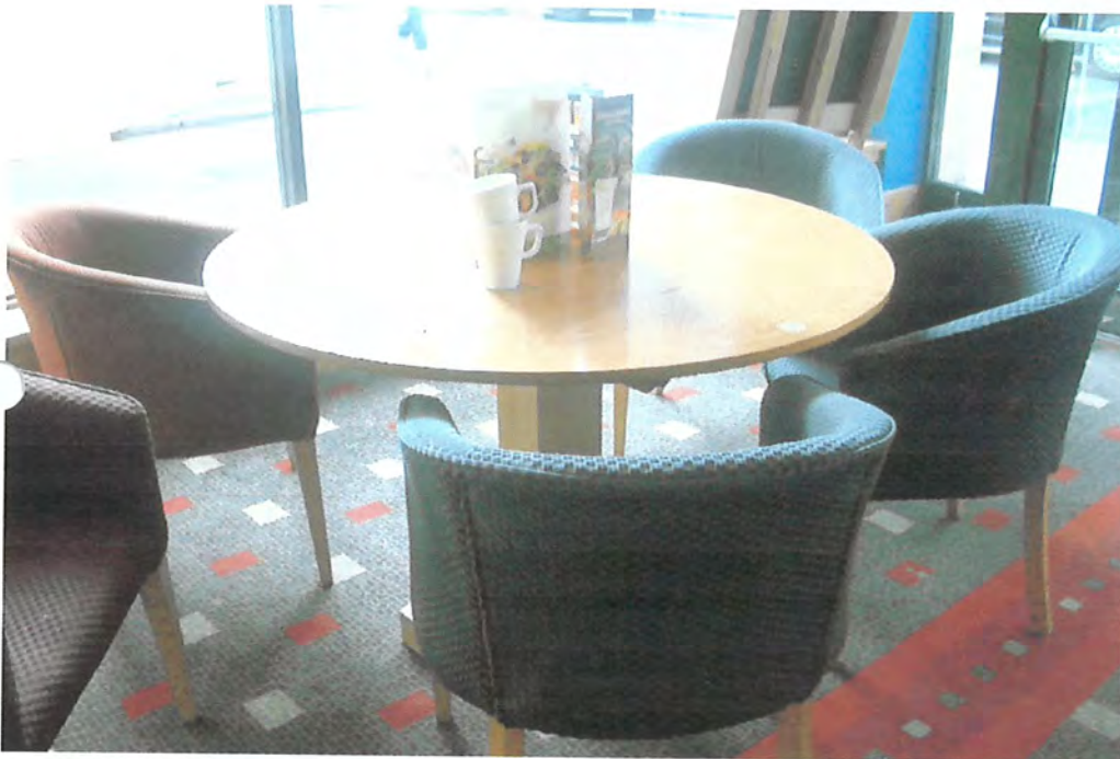
ROUND TABLE CENTER LEG