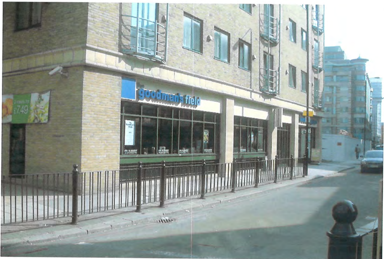
Prescot Street elevation.