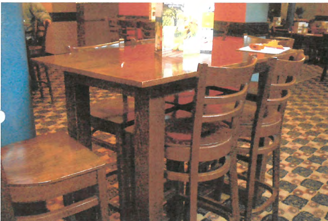
STANDARD TALL TABLE L = 137 cm W = 76 cm H = 107 cm