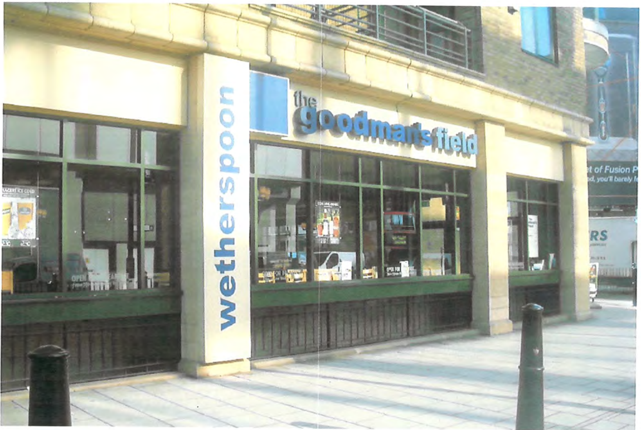
Mansell Street elevation.