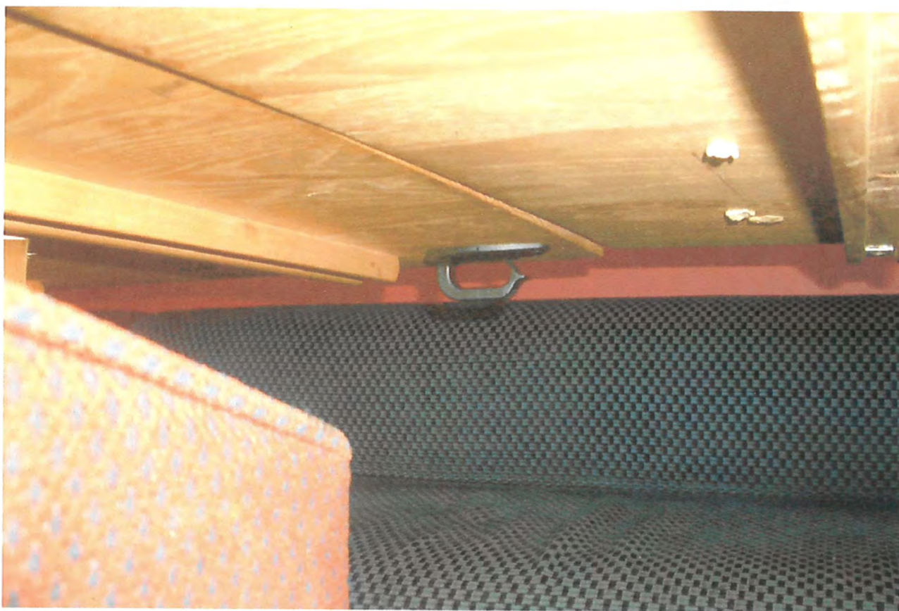
Chelsea Clips on most tables. But no signage anywhere.