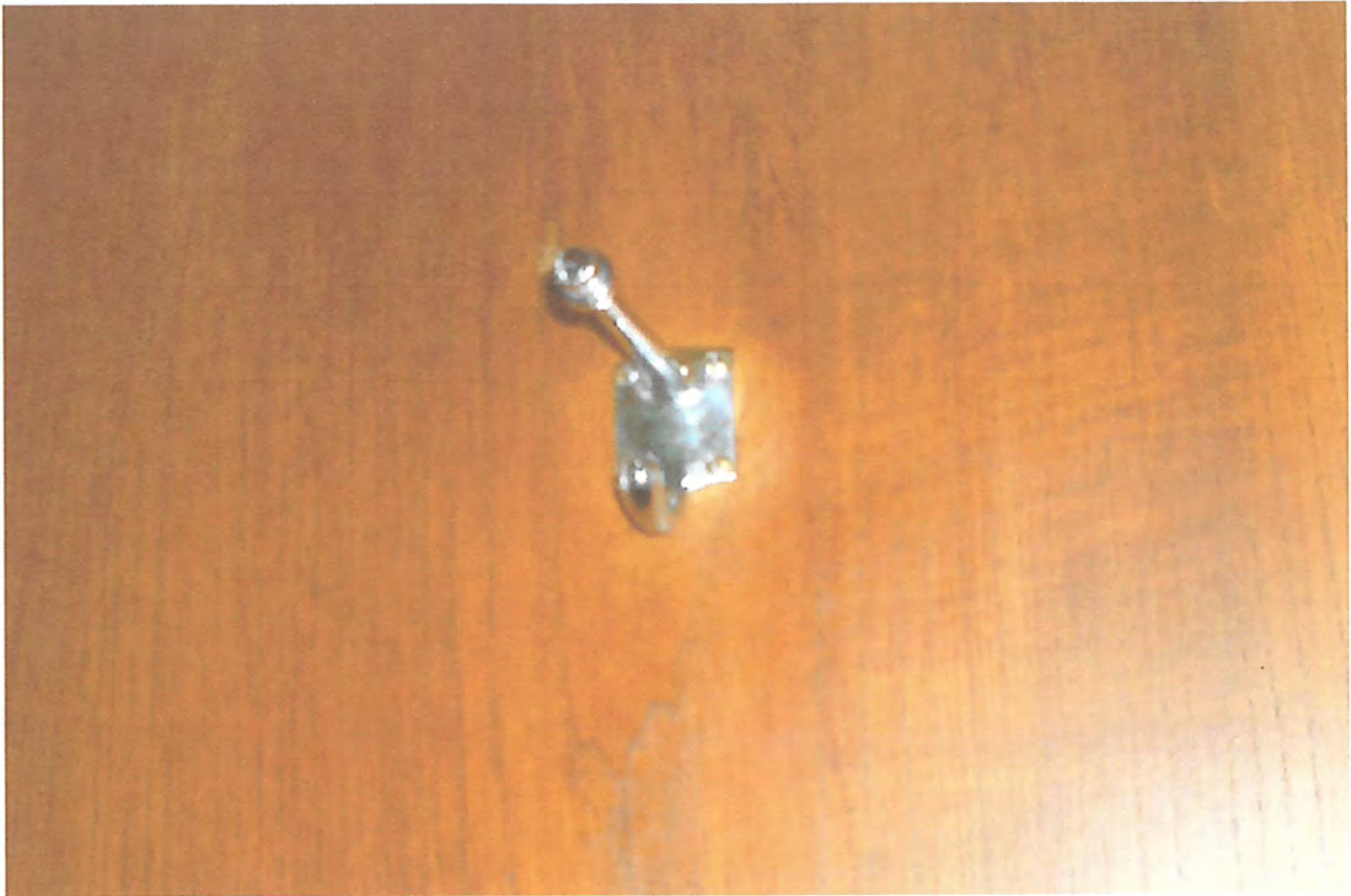
Hook on the back of stall doors.