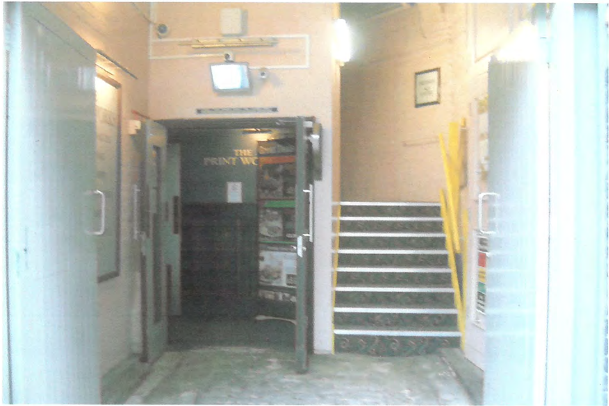
Head down steps to pub.