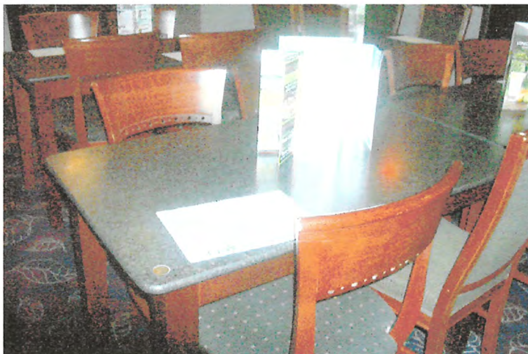
'MARBLE" TOP TABLE