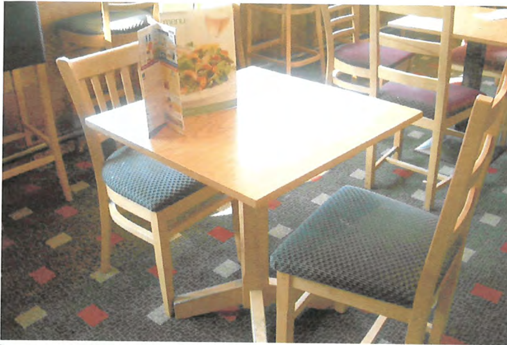
SQUARE TABLE CENTER LEG L = 69 cm W = 69 cm H = 73 cm