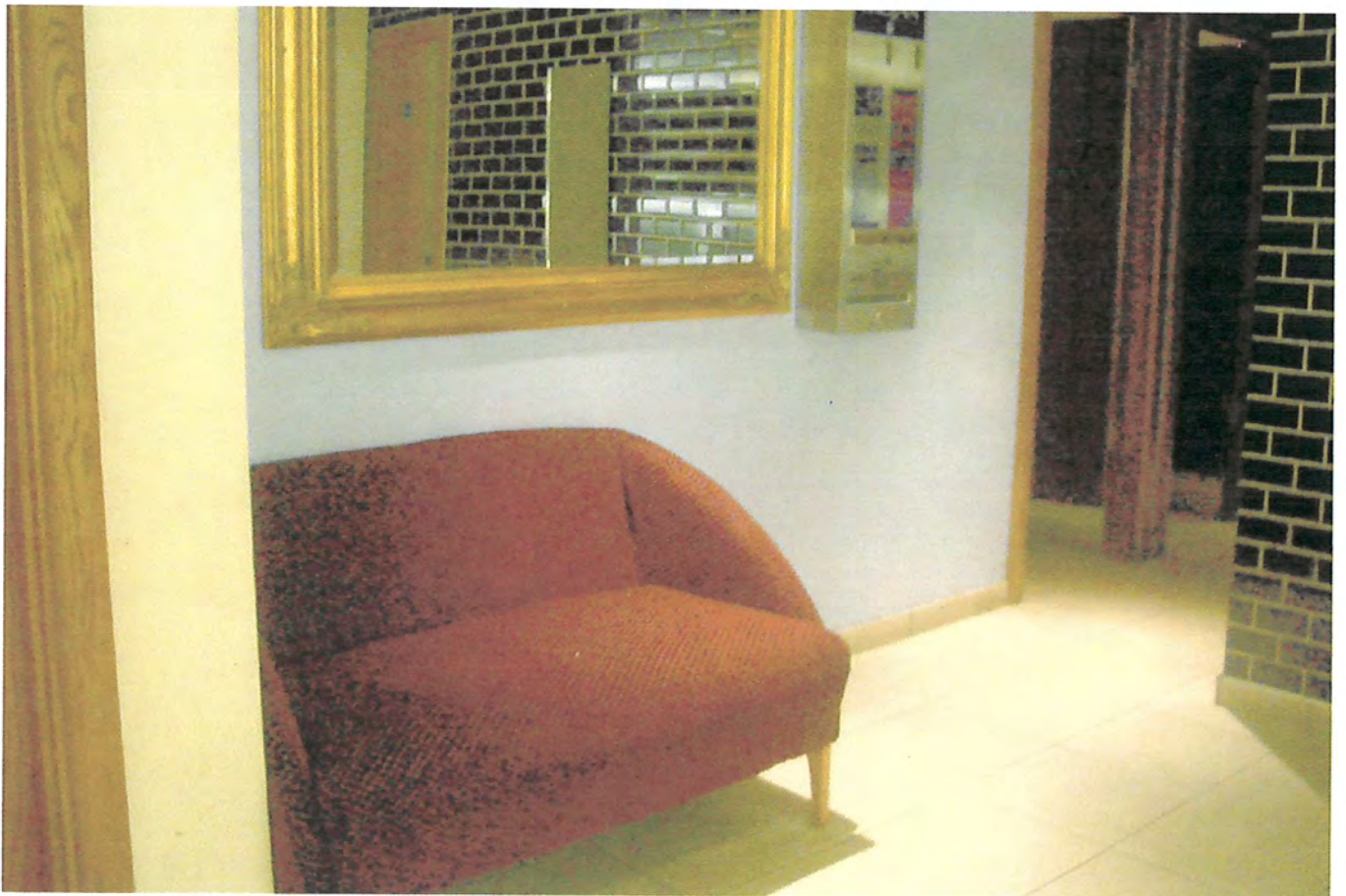
Goodman's Field TOILET