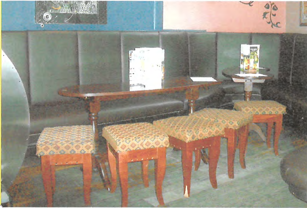
KIDNEY SHAPE TABLE L = 122 cm W = 49 cm H = 74 cm