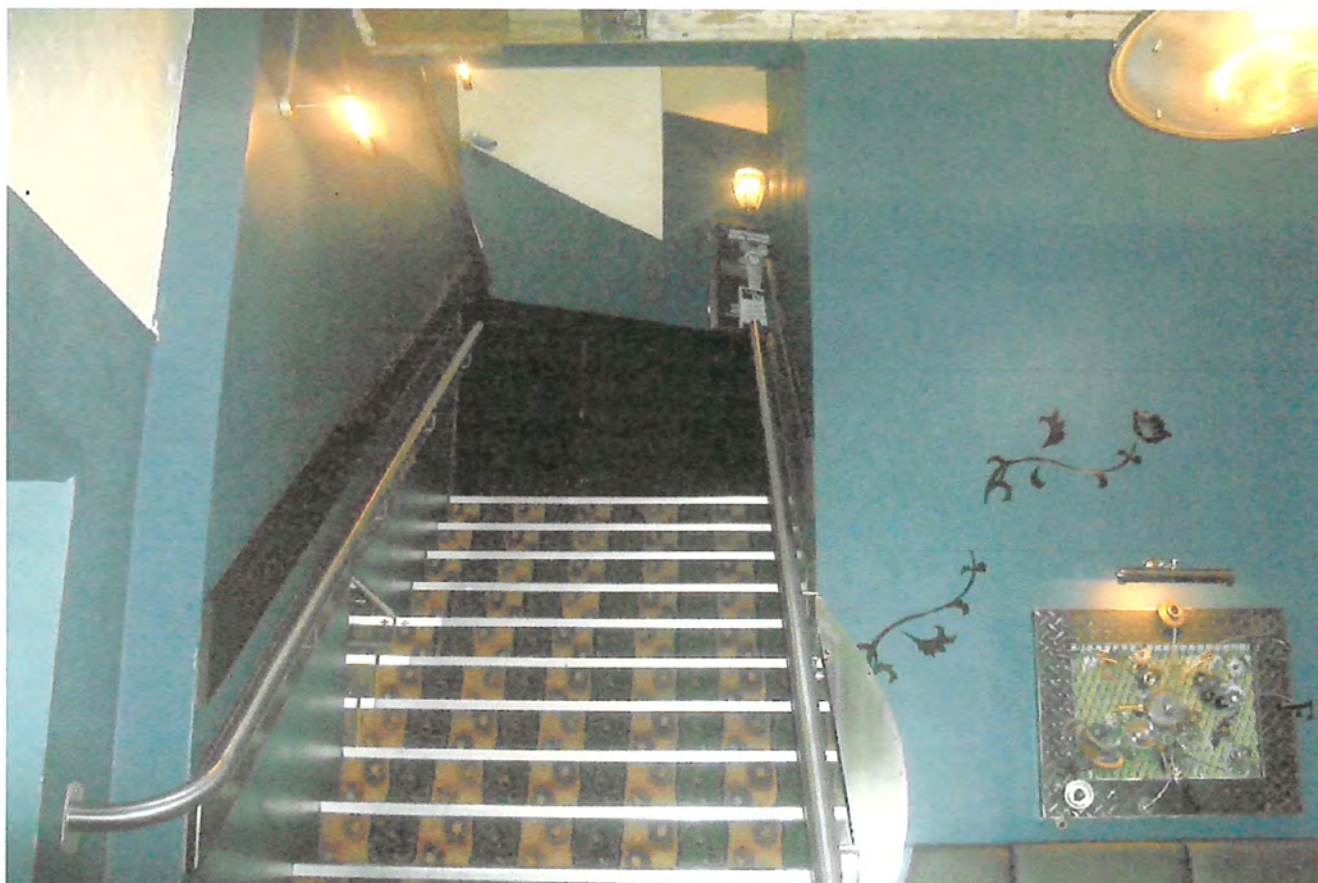
Exit up steps.