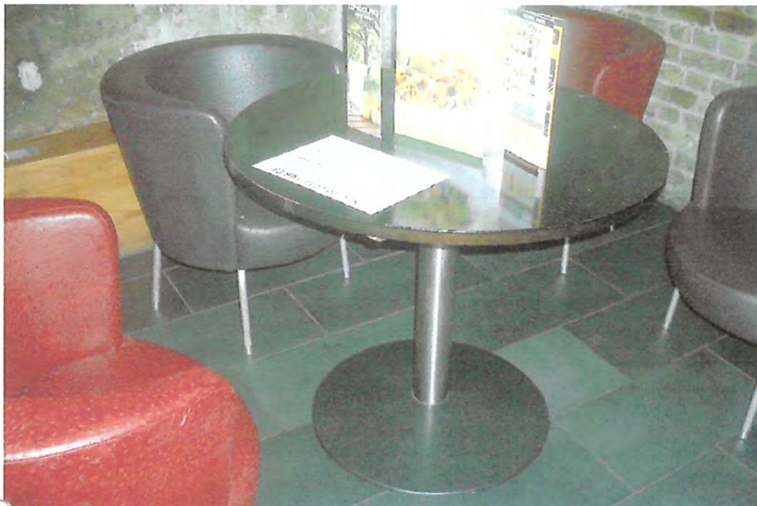
ROUND TABLE METAL LEG D = 90 cm H = 77 cm LEG D = 9 cm