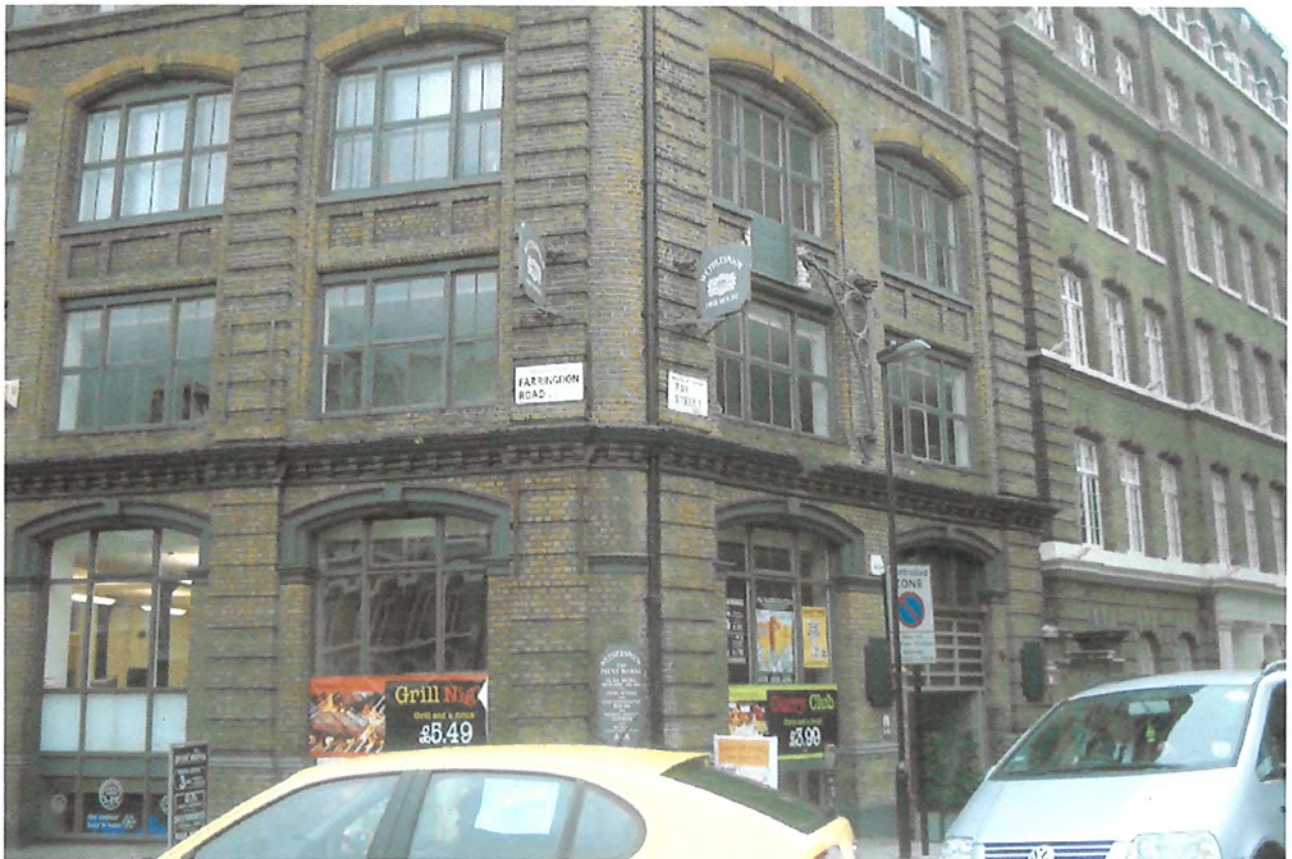
Entry on Ray Street